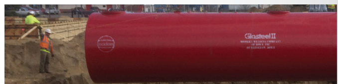
Cover Story Continued from Page 1

PEI RP 900 on Inspection & Maintenance of UST Systems: The 2021 edition of this recommended practice has been updated and is now available on the PEI website .