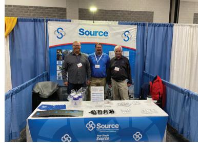
Top: WPMA in Las Vegas, NV. Bottom left: Southeast Petro-Food Exposition in Myrtle Beach, SC. Bottom right: NECSEMA in Springfield, MA.

The early part of 2022 opened with a trio of successful trade shows: WPMA (Booth #208) Feb. 22-24 in Las Vegas, NV, Southeast Petro-Food Expo (Booth #317) March 2-3 in Myrtle Beach, SC, and NECSEMA (Booth #55) March 16 in Springfield, MA.