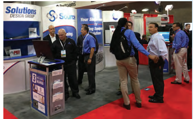
The Source team exhibited Source's unique services and solutions at the PEI Convention in Atlanta.

Several interviews from the 2016 NACS Show are available on NACS's Convenience Matters podcasts . Topics include "Fueling Sales," which offers insights on what it takes to be a successful fuel retailer, "Instant Party," which discusses the impact music plays on sales, and more.